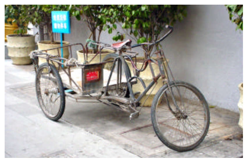
It is common in China to see people on bicycles with large carts attached; many times people are bringing wares for sale in the streets with these carts.