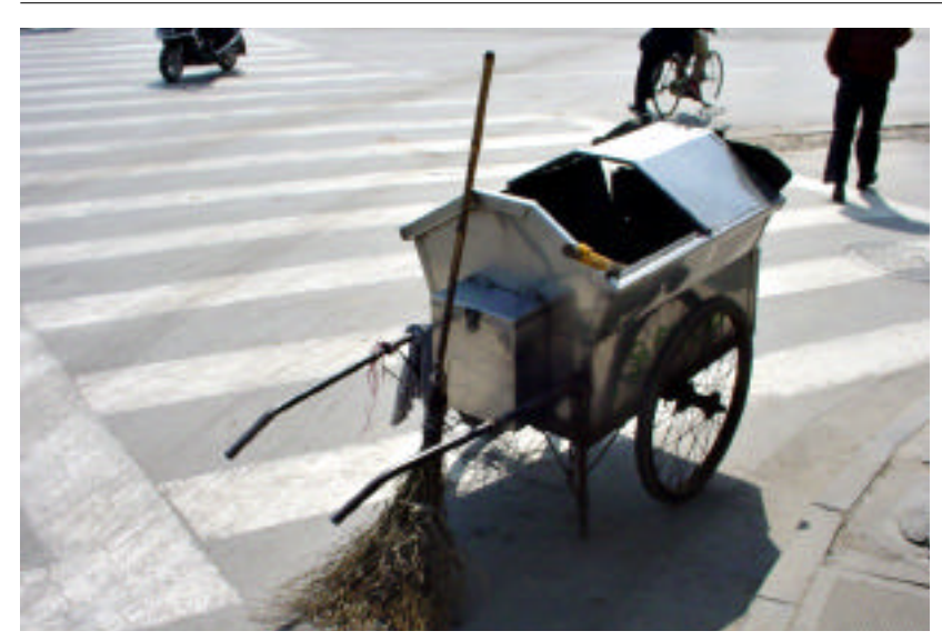
People solf handmade brooms in China, and it was common to see them everywhere.